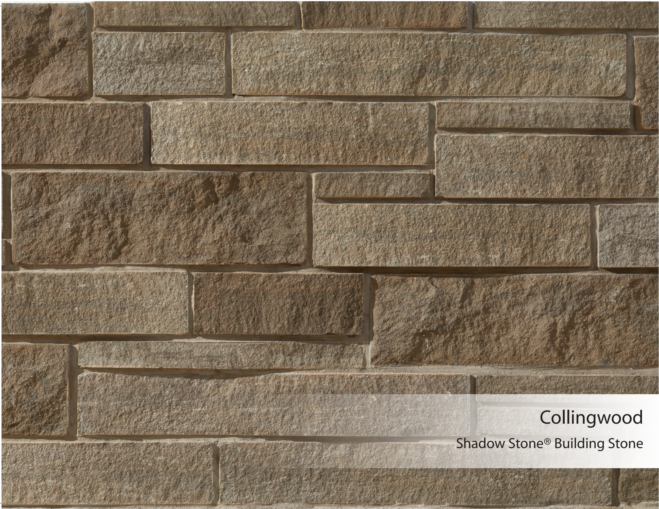
Collingwood Shadow Stone® Building Stone