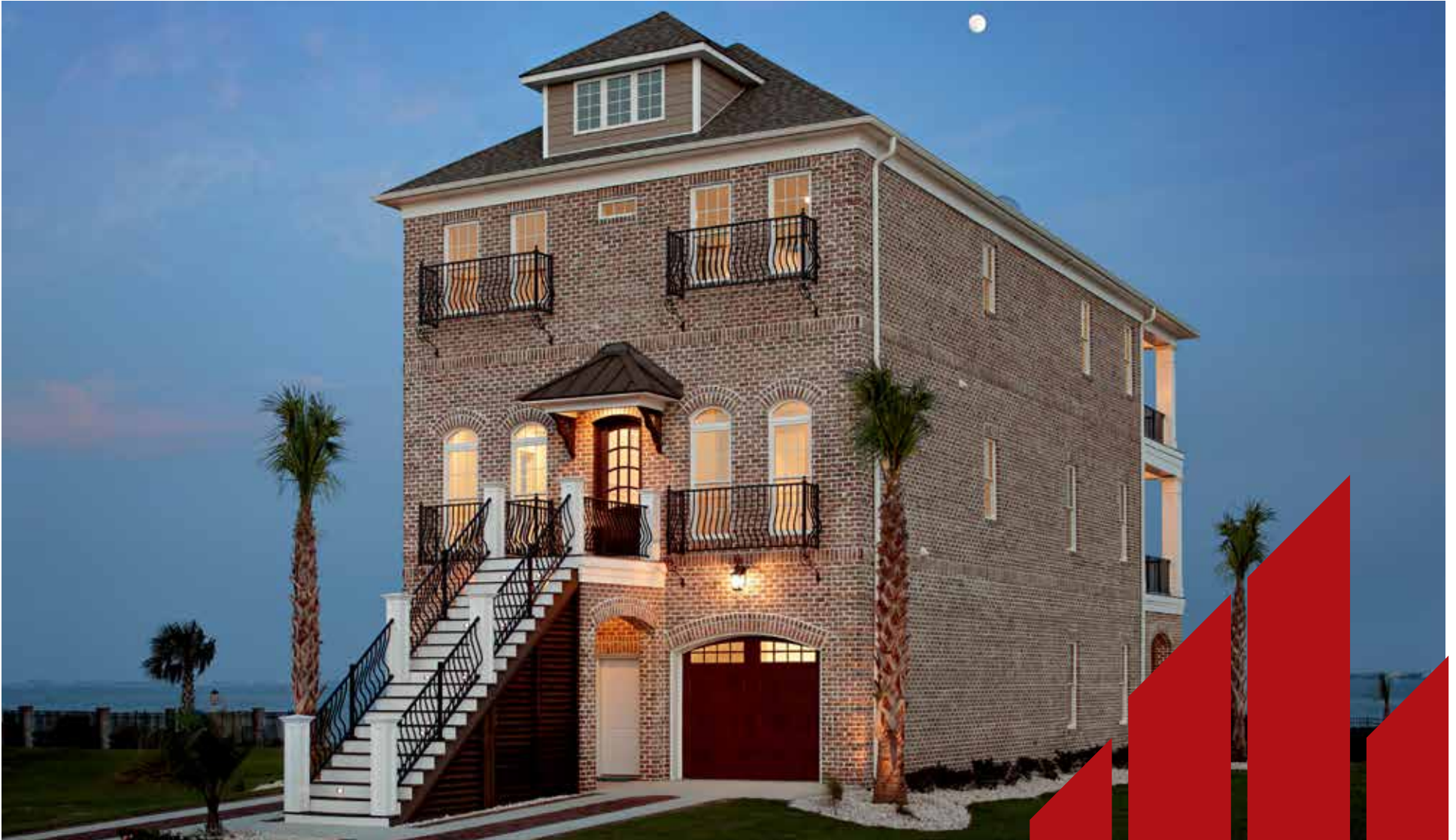
Brick names: Spalding Tudor