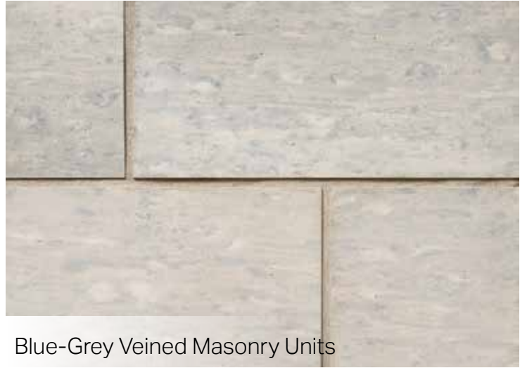
Blue-Grey Veined Masonry Units