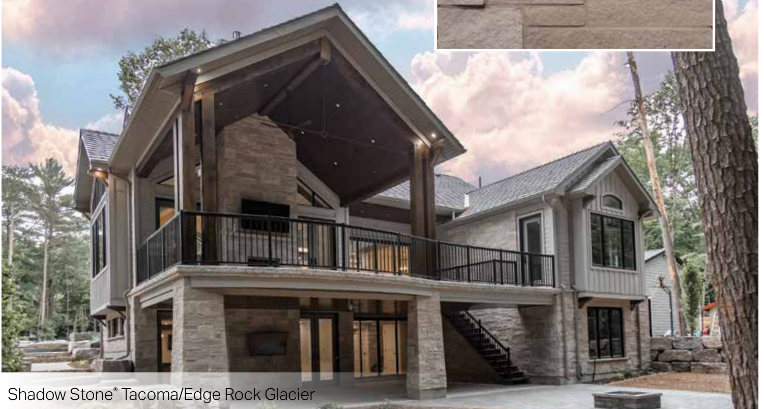
Shadow Stone® Tacoma/Edge Rock Glacier