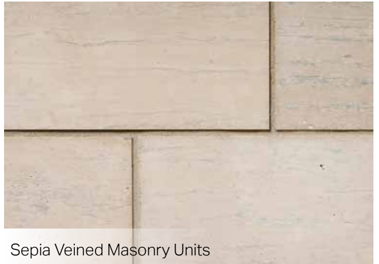
Sepia Veined Masonry Units