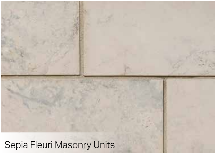
Sepia Fleuri Masonry Units