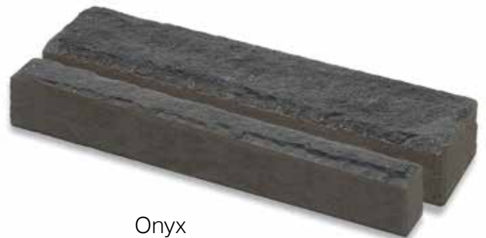
Onyx (accent color available in 2 sizes)

Available in two sizes, this deep grey can be blended in with any of our full bed stone products to add an extra punch of color.