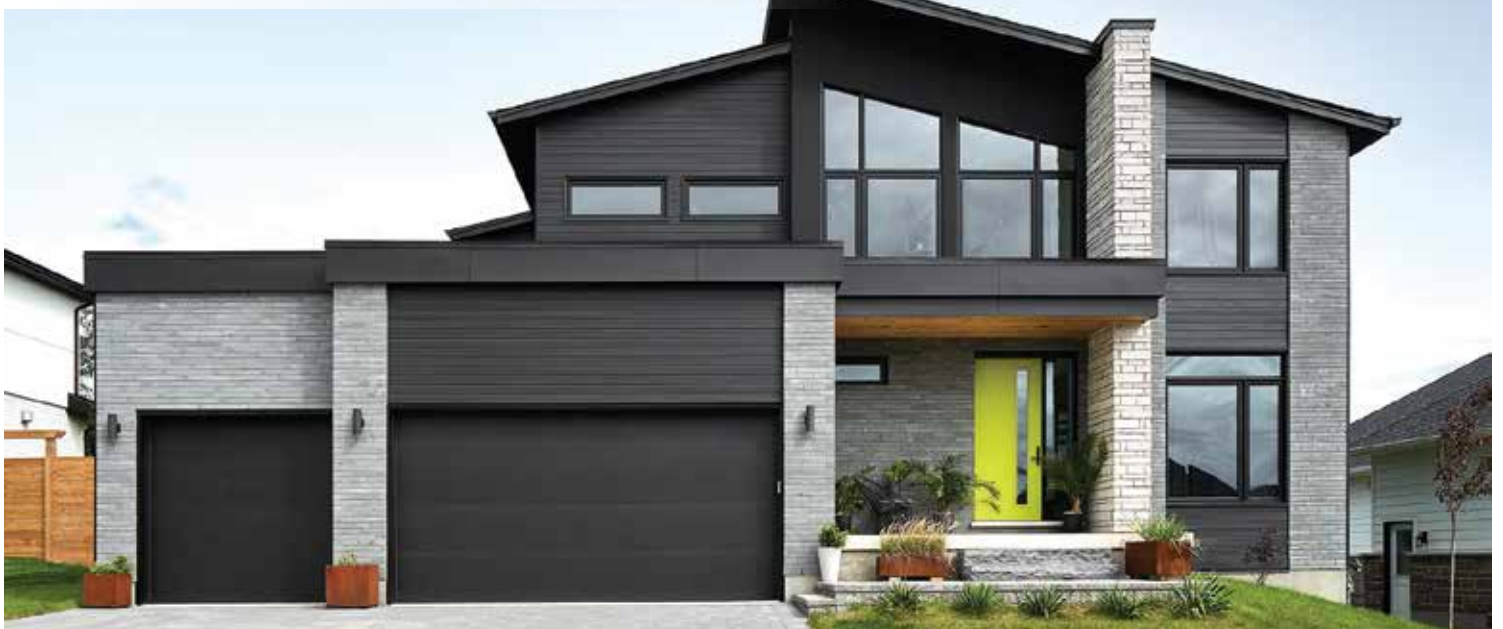
Architectural Linear Series Brick Obsidian/ Urban Ledge Stone Avalanche