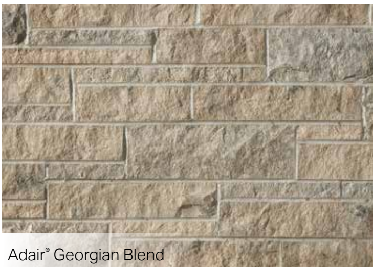
Adair® Georgian Blend