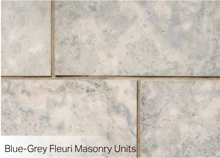
Blue-Grey Fleuri Masonry Units