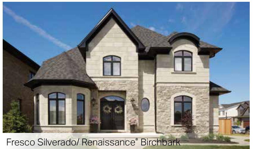
Fresco Silverado/ Renaissance® Birchbark