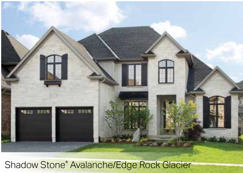
Shadow Stone® Avalanche/Edge Rock Glacier