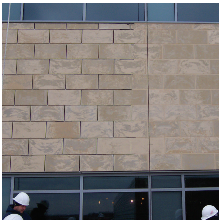
Step 7: Joints Sealed with Backer Rod and Silicone Sealant