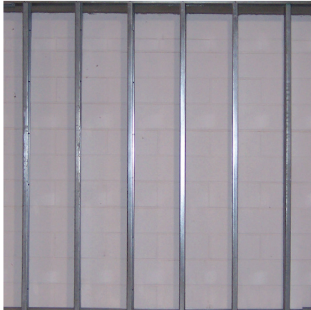
Step 1: Steel Studs