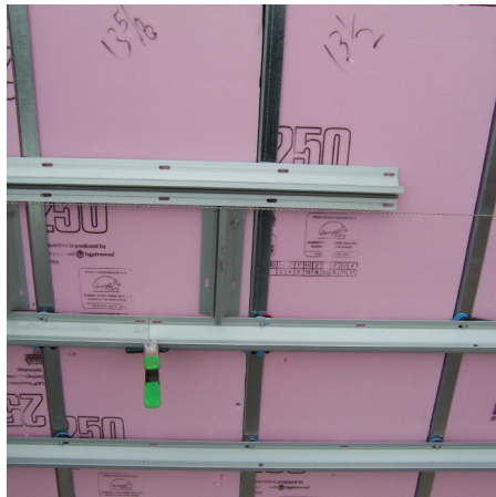
Step 5: Install Gridworx Channels over "Z" channels and rigid insulation