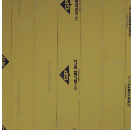
Step 2: Exterior Grade Sheathing