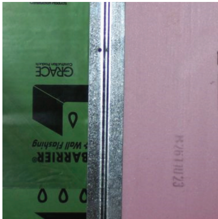
Step 4: Install "Z" channels and then Rigid Insulation between "Z" channels