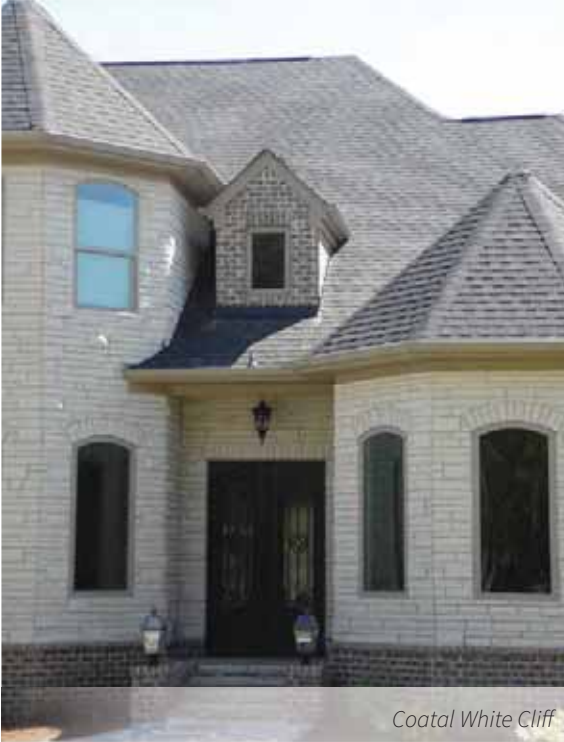
Coatal White Cliff