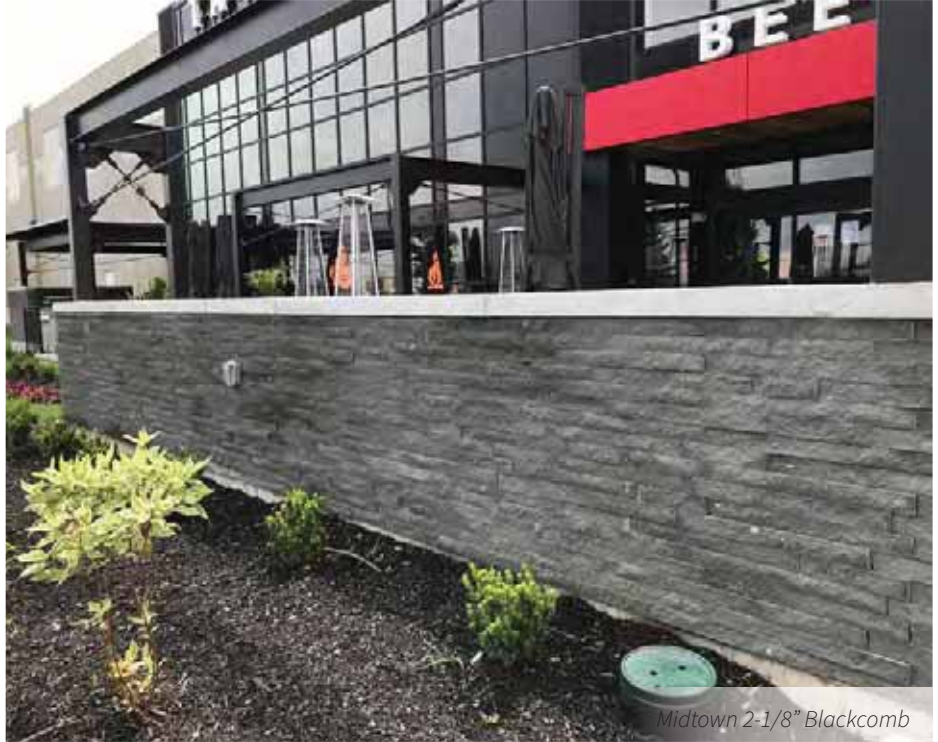
Midtown 2-1/8" Blackcomb