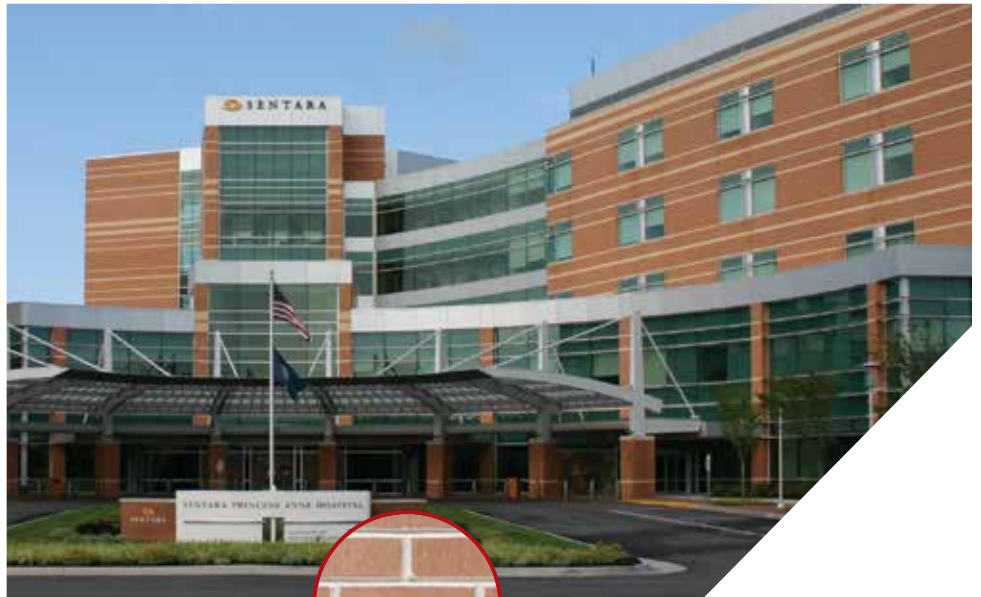
Sentara Princess Anne Hospital Virginia Beach, VA HDR Architecture, Inc.

Tan Velour Modular and Oatmeal Velour Modular