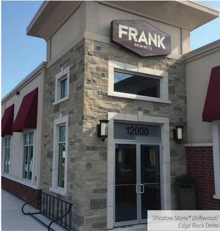
Shadow Stone® Driftwood/ Edge Rock Delta