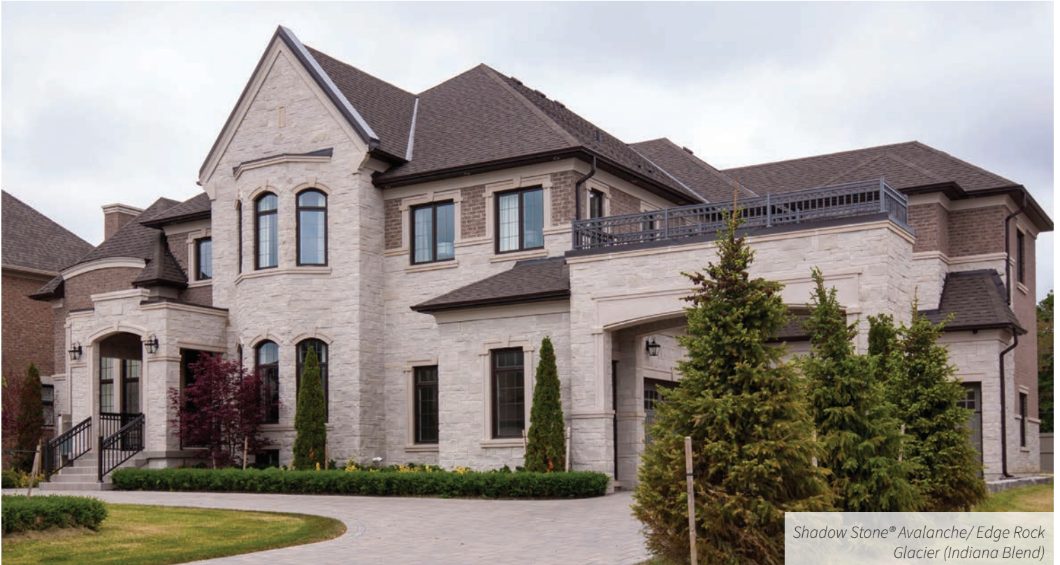
Shadow Stone® Avalanche/ Edge Rock Glacier (Indiana Blend)

Both of these stone styles are beautiful on their own, but when blended, they are ideal for those craving something different. The colours and sizes of these products are perfectly suited to be combined.