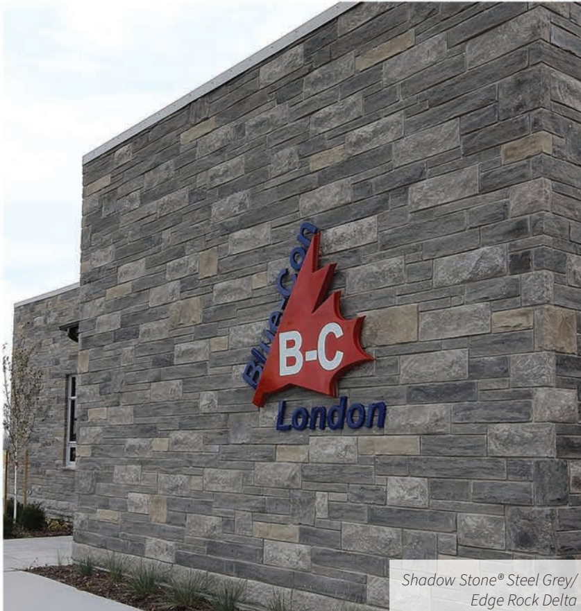
Shadow Stone® Steel Grey/ Edge Rock Delta