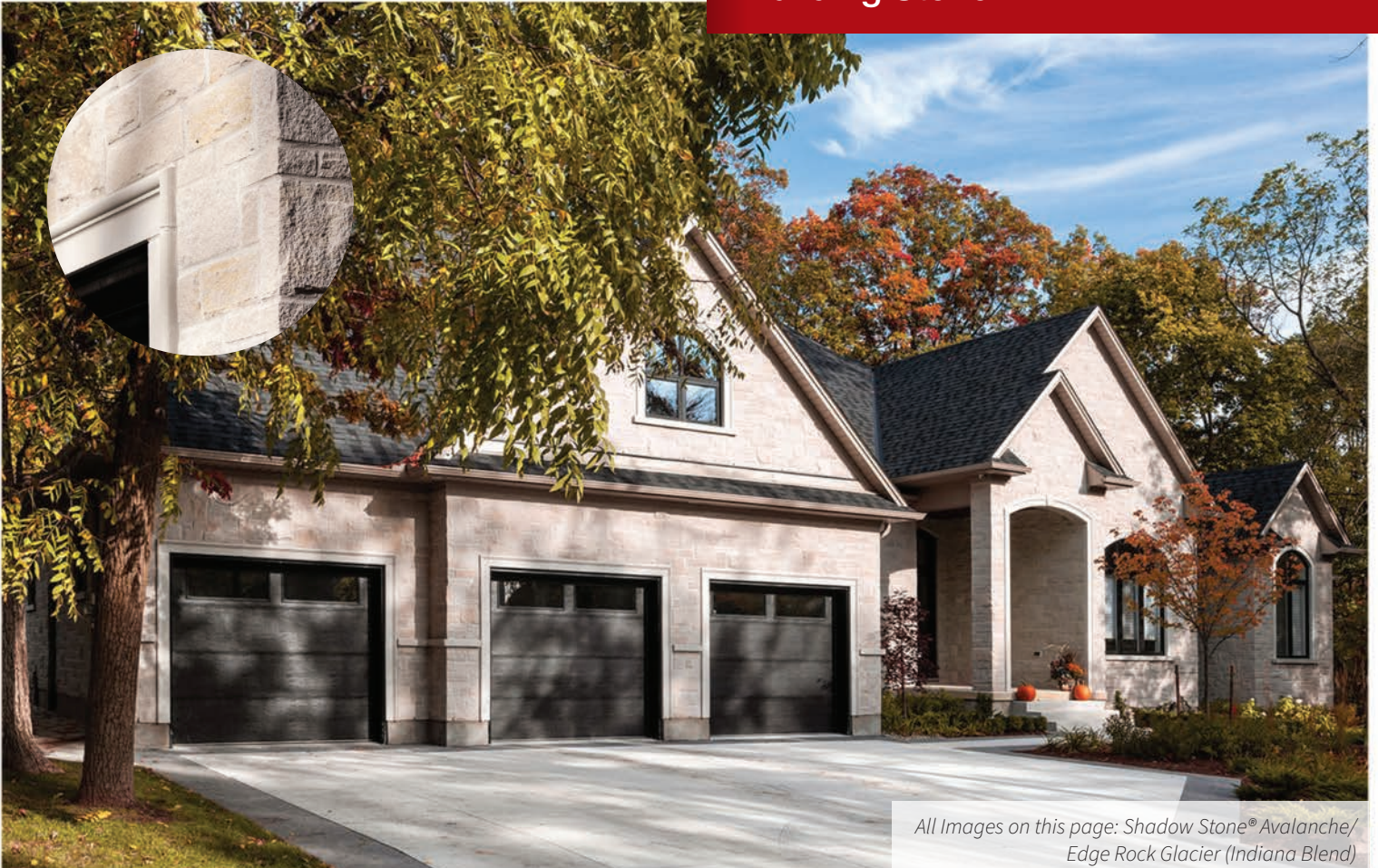
All Images on this page: Shadow Stone® Avalanche/ Edge Rock Glacier (Indiana Blend)