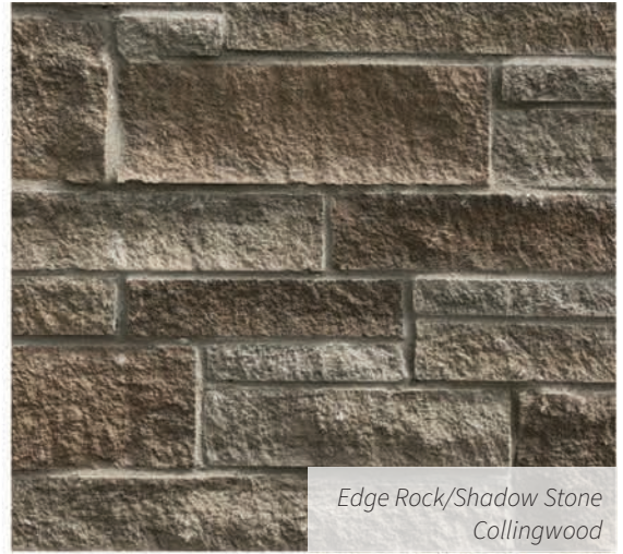
Edge Rock/Shadow Stone Collingwood