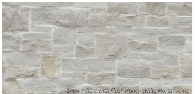
Shown here with Flush Honey-White Mortar Joint