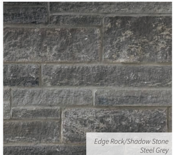
Edge Rock/Shadow Stone Steel Grey