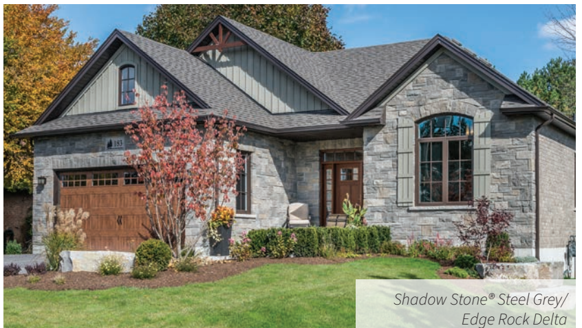
Shadow Stone® Steel Grey/ Edge Rock Delta

Edge Rock EDG102 bonds out with two EDG50s or Shadow Stone® SHA50s, or 1 SHA22 and 1 SHA75. The larger 10" size and subtle range of texture produced by incorporating Edge Rock with Shadow Stone® evokes a timeless look that can only be found with higher priced quarried products.