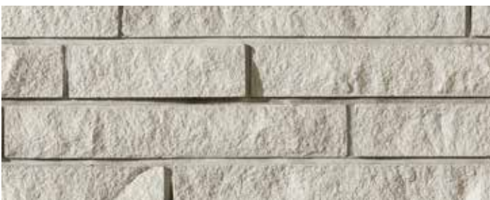
Biscayne - Arriscraft Thin Building Stone Midtown Series

ANNOUNCED NOV. 14. Our Cleveland County plant has two new additions: Niagara Mist and Nightshadow. These new colors are a great representation of the unique visual palette we are able to achieve at this plant, and one that continues to grow in popularity within our commercial markets.