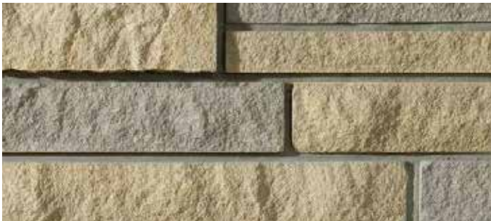
Cape Cod - Arriscraft Thin Building Stone Coastal Series

ANNOUNCED OCT. 12. Frasier Canyon Brick’s signature texture is highlighted by a delightfully balanced mix of light and dark tones and provides a nice “in-between” option when compared to Bryce Canyon and Logan Canyon of the Canyon Brick Series.