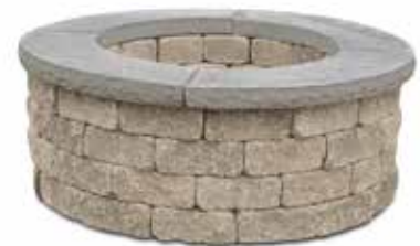
Entertainer 75 Outdoor Fire Pit