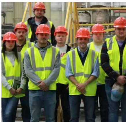
ETSU STUDENTS VISIT