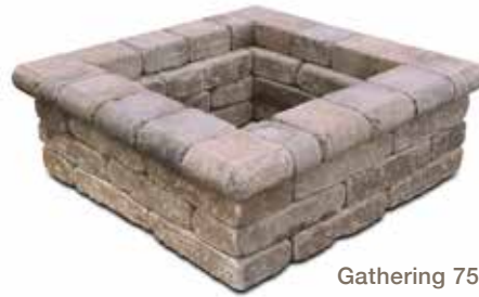
Gathering 75 Outdoor Fire Pit

ANNOUNCED FEB. 1. Bryce Canyon and Copper Canyon are the two newest colors of our industry-unique Canyon Brick Series. Bryce Canyon's earthy body is highlighted with subtle cream-colored accents, making the series' trademark texture appear even more striking. True to its name, Copper Canyon has a definitive copper-colored face with varying degrees of light and dark tones that truly emulate the character of a furrowed landscape. Both colors are an excellent choice for new residential construction.