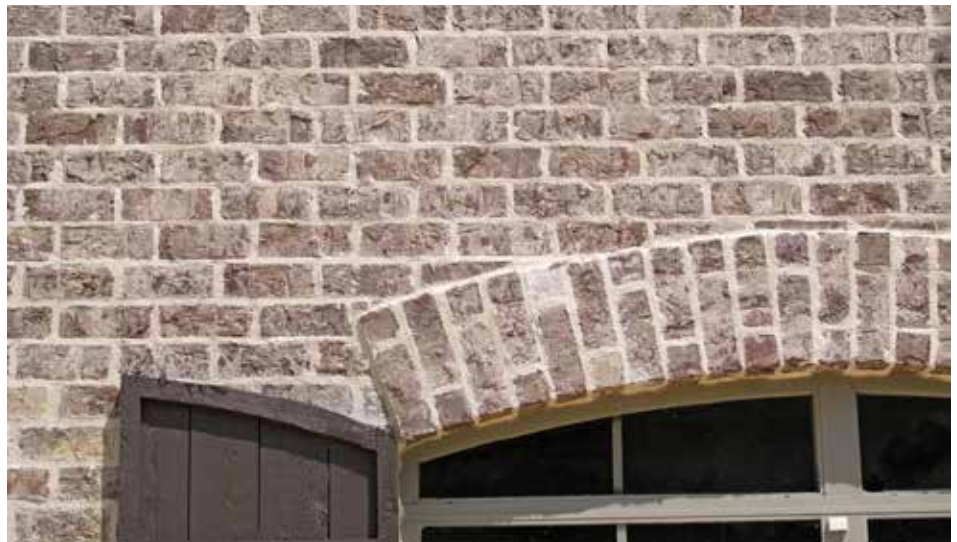
COLUMBUS BRICK COMPANY