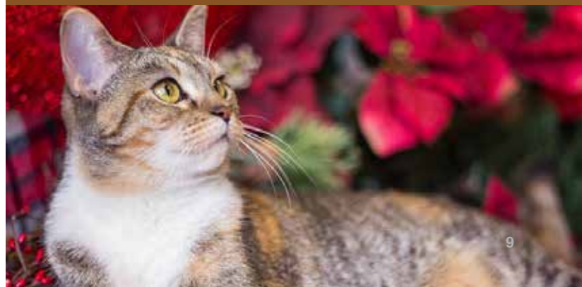
Photos of Washington County Animal Shelter pets

By the end of the event, over 79 animals had been adopted, as well as the shelter receiving much-needed supplies and over $3,500 in donations. Thanks to all those General Shale staff members who helped with this important event. Your support has made a world of difference in the lives of so many animals this season.