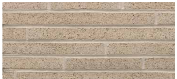
Andover - Impressionist Series

ANNOUNCED FEB. 28. Two new fire pits have been added to our lineup of Outdoor Living Products. The Gathering 75 Square Fire Pit has the same elegance as the Gathering Grill, only without the grill insert. The Entertainer 75 Round Fire Pit has all the charm of the original but with a more rugged look and slightly easier setup. Both kits require only beginner-level building knowledge to install.