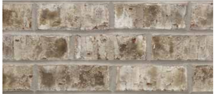
Frasier Canyon Series

ANNOUNCED AUG. 29. Driftwood is a “true brown” brick characterized by heavy face distressing that uniquely captures a naturally organic look. If the desired finish for your new home calls for natural flair, Driftwood might be just the right choice!