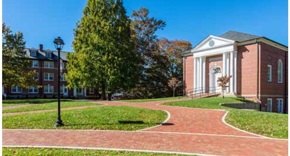
PAVER AWARD FOR KING UNIVERSITY