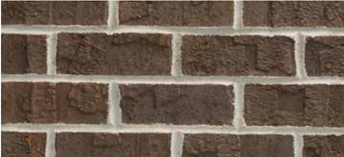
Driftwood Brick Series