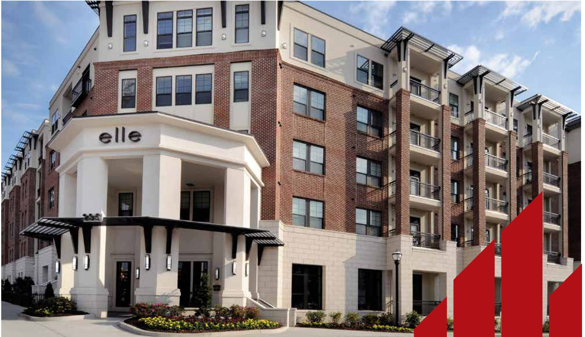
Brick name: Raleigh Court