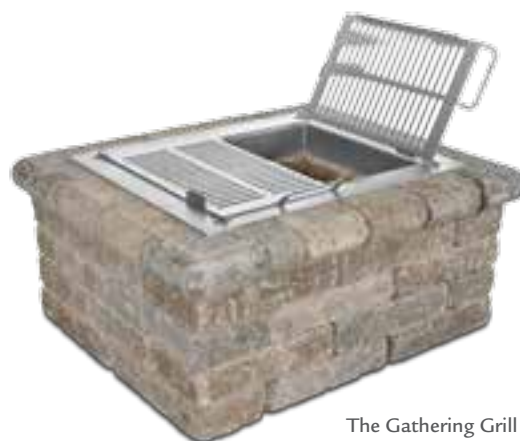
The Gathering Grill