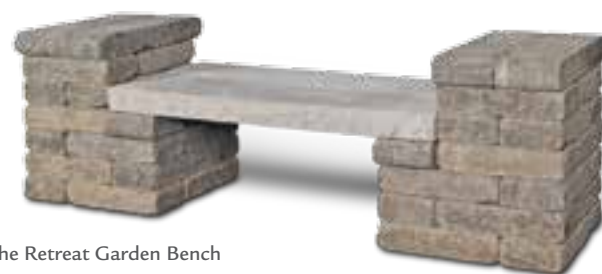
The Retreat Garden Bench