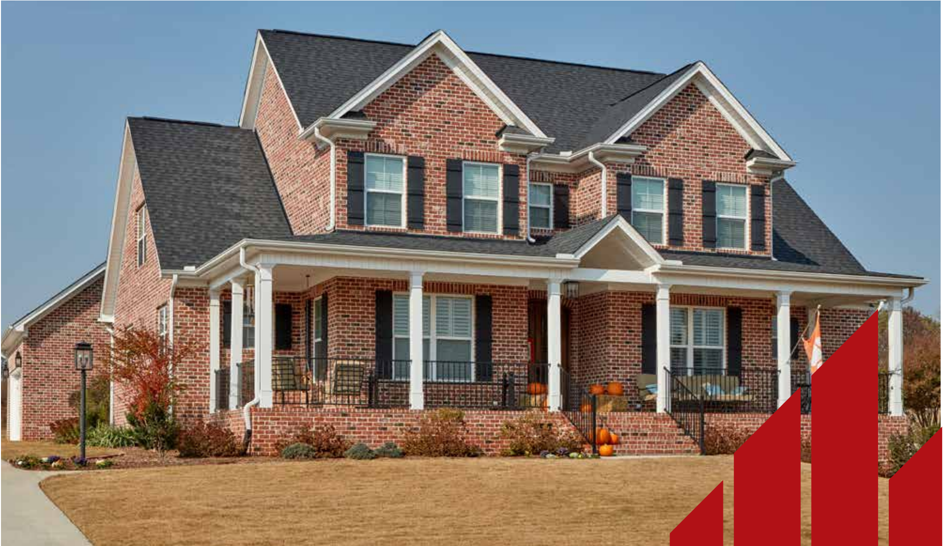
Brick names: Olde Georgian Tudor