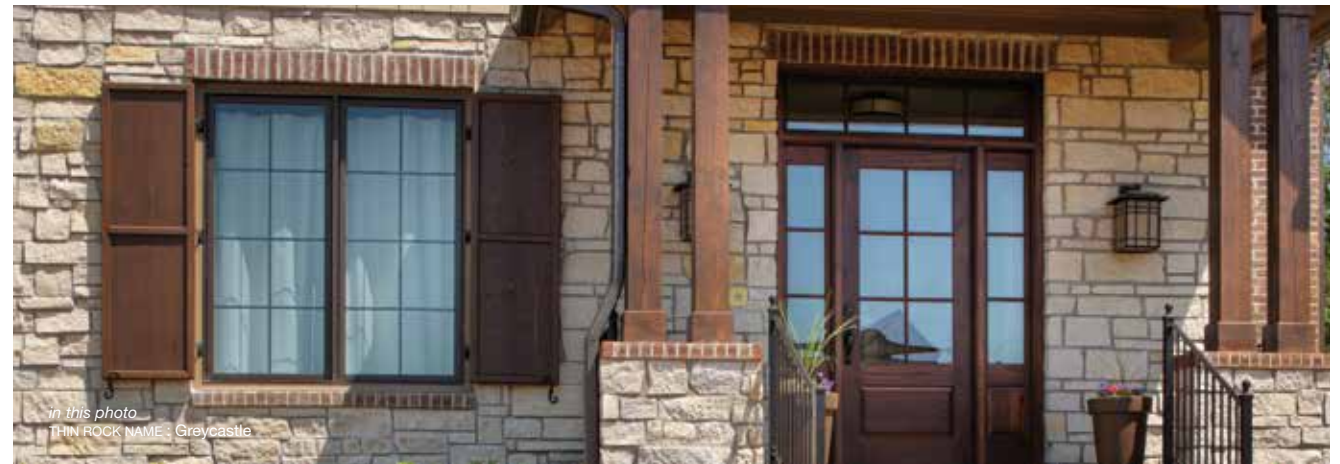
in this photo THIN ROCK NAME : Greycastle