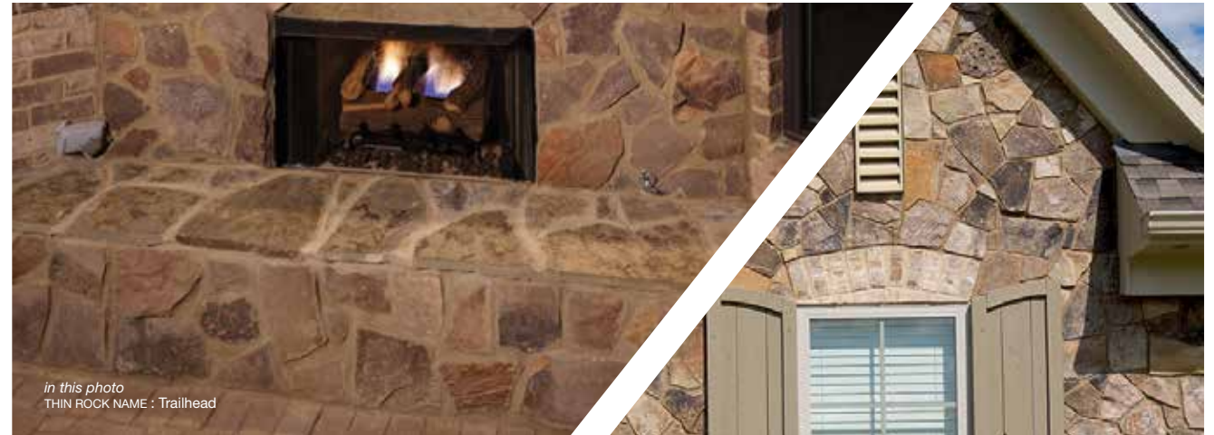
in this photo THIN ROCK NAME : Trailhead

BEAUTIFUL, NATURALLY Authentic quarried stone cut thin, Thin Rock offers designers the high-end look of natural handcrafted stone for a fraction of the cost.