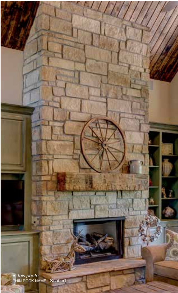
in this photo THIN ROCK NAME : Seabed