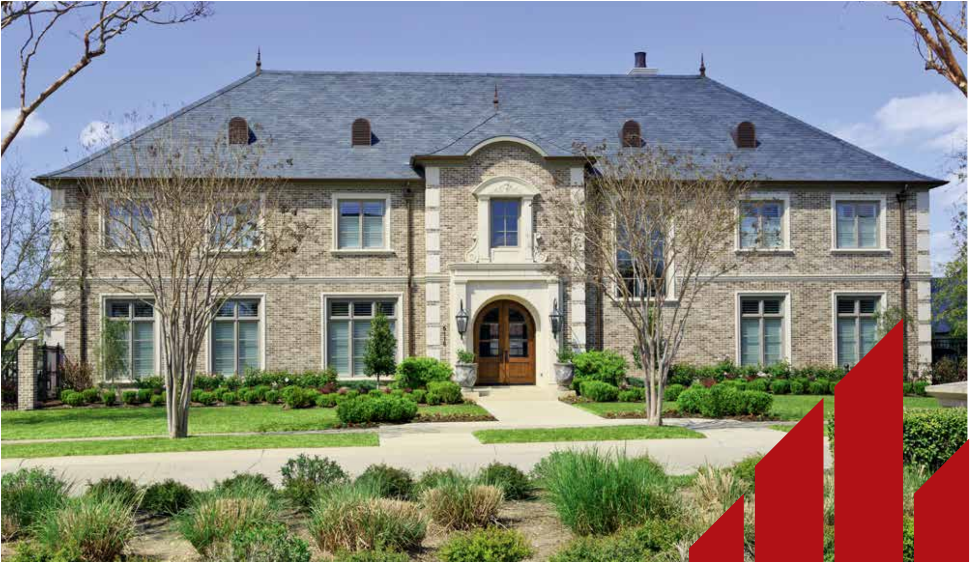
Brick names: Old Carbondale & Ironworks