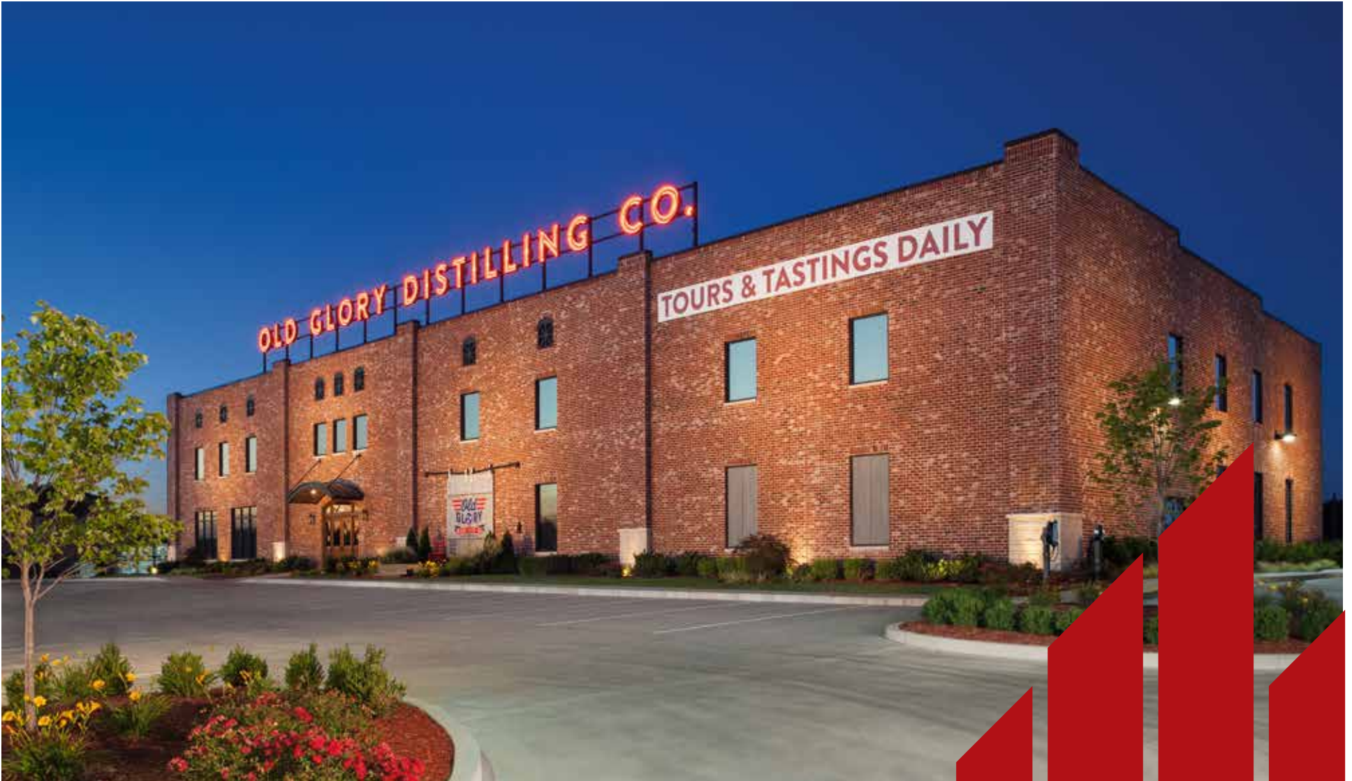
Brick name: Olde Georgian Tudor