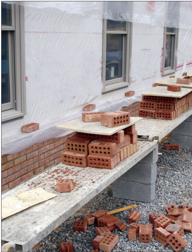
Hollow brick can be laid in the same manner and with the same productivity as its solid counterpart, with the lighter weight helping reduce installer fatigue.

A brick's weight is an extremely critical value for this program. The functional unit in BEES is a square foot of wall surface. Most data (e.g. emissions and energy) are given in terms of per pound of brick. Thus, the weight of a square foot of wall surface is crucial. Every pound of brick saved equals a reduction in the impact on the environment. Brick is fired to lower absorptions with the increased coring. Emissions standards and limits set by the U.S. Environmental Protection Agency (EPA) are based on tons per hour. Lighter brick allow a manufacturer to make more units for a given amount of emissions. The lighter weight also means less fuel for shipping.