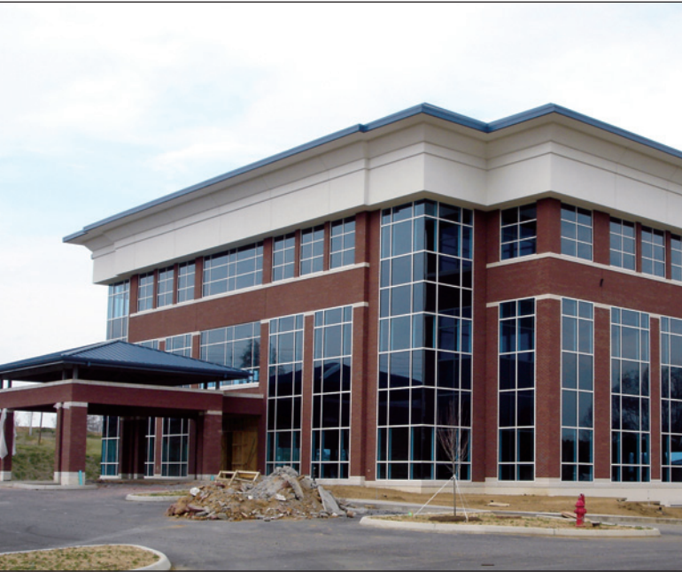
Projects incorporating hollow brick can reap the benefits of not only cost efficiencies, but also reduced material waste and other sustainable factors.